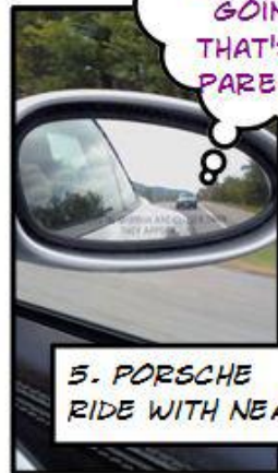
5. PORSCHE RIDE WITH NEAL

"Spread the love of God through your life but only use words when necessary." - Mother Teresa