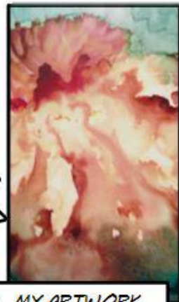
7. MY ARTWORK